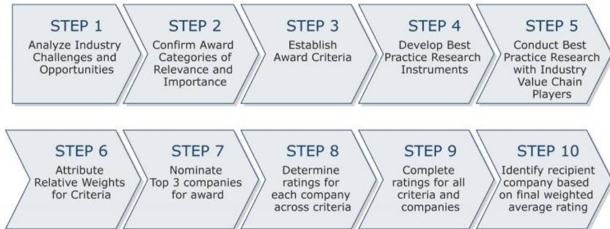
Chart 2: Frost & Sullivan’s 10-Step Process for Identifying Award Recipients