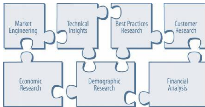
Chart 5: Benchmarking Performance with TEAM Research

Frost & Sullivan's TEAM Research methodology represents the analytical rigor of our research process. It offers a 360-degree view of industry challenges, trends, and issues by integrating all seven of Frost & Sullivan's research methodologies. Our experience has shown over the years that companies too often make important growth decisions based on a narrow understanding of their environment, leading to errors of both omission and commission. Frost & Sullivan contends that successful growth strategies are founded on a thorough understanding of market, technical, economic, financial, customer, best practices, and demographic analyses. In that vein, the letters T, E, A and M reflect our core technical, economic, applied (financial and best practices) and market analyses. The integration of these research disciplines into the TEAM Research methodology provides an evaluation platform for benchmarking industry players and for creating high-potential growth strategies for our clients.