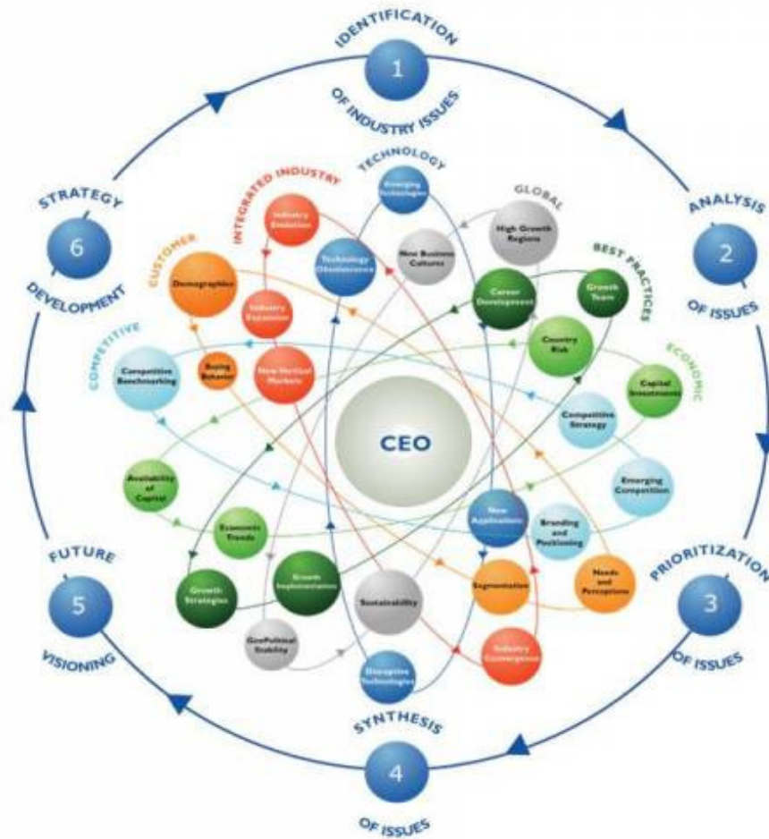
Chart 4: How the CEO's 360-Degree Perspective™ Model

The CEO 360-Degree Perspective™ model enables our clients to gain a comprehensive, action-oriented understanding of market evolution and its implications for their companies' growth strategies. As illustrated in Chart 5 below, the following six-step process outlines how our researchers and consultants embed the CEO 360-Degree Perspective™ into their analyses and recommendations.